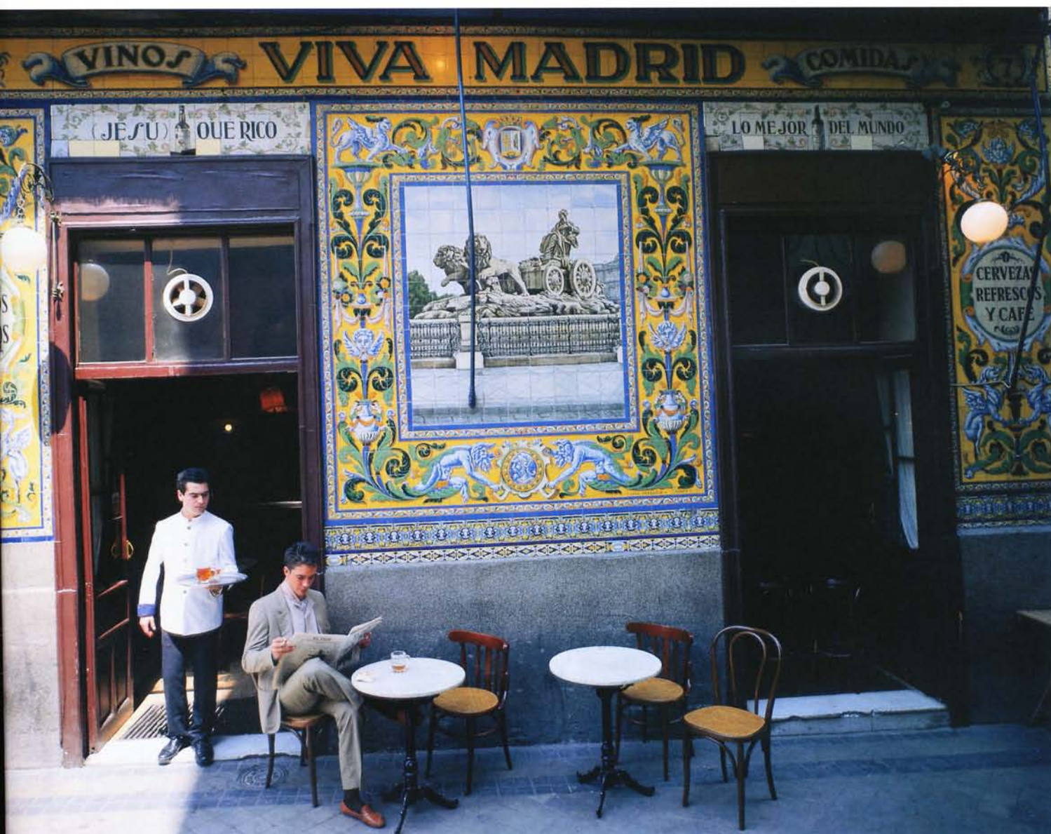
Nightlife or art. In Madrid no-one has to choose between the two.

small “Jerez Hostel” on the 6th floor close to the entertainment district on the Gran Vía. Although there is no breakfast at the Jerez, there are numerous breakfast cafés in the vicinity. Those willing to spend a little more will find a pleasant place to stay for longer if they wish in the AC hotels. The small five-star hotel AC Palacio de Retiro is ideally located for a visit to the museums in the “Golden Museum Triangle” of Thyssen, Prado and Reina Sofia. The modern hotel Urban, with its excellent blend of avant-garde architecture and old works of art from overseas, is a good point of departure for a stroll through the old part of the city. For architecture fans, the Hotel Puerta America is an absolute must. Norman Foster, Jean Nouvel, Zaha Hadid and other star architects have created twelve differently de-